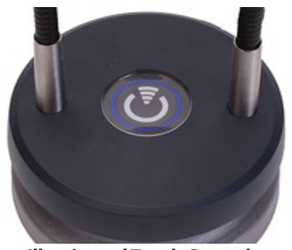
Illuminated Touch Control