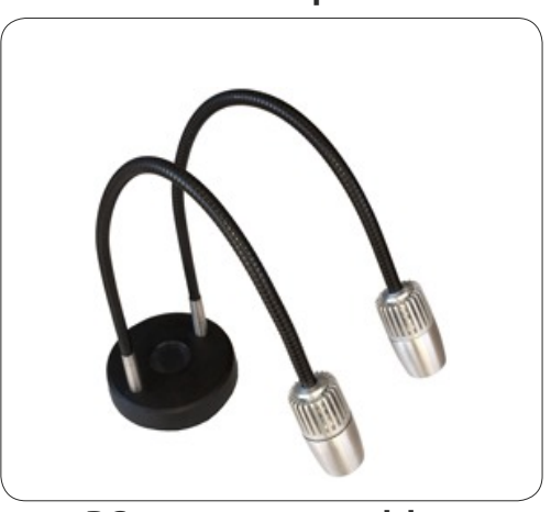
DC remote power model