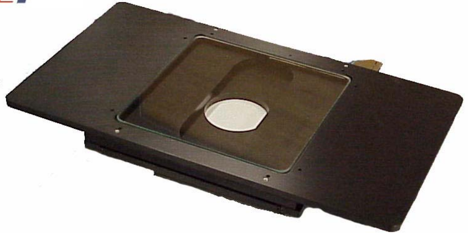
Transmitted Light Model Shown