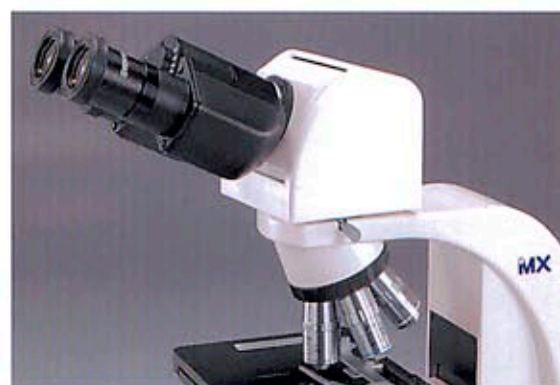
MA957 ERGONOMIC TILTING BINOCULAR HEAD (SIEDENTOPF TYPE)