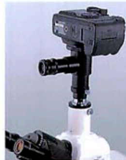
MA150/60 Camera attachment

These attachments are used to mount the camera with T2 adapter ring to the photo tube.