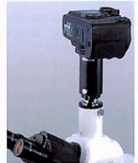
MA150/50 Camera attachment